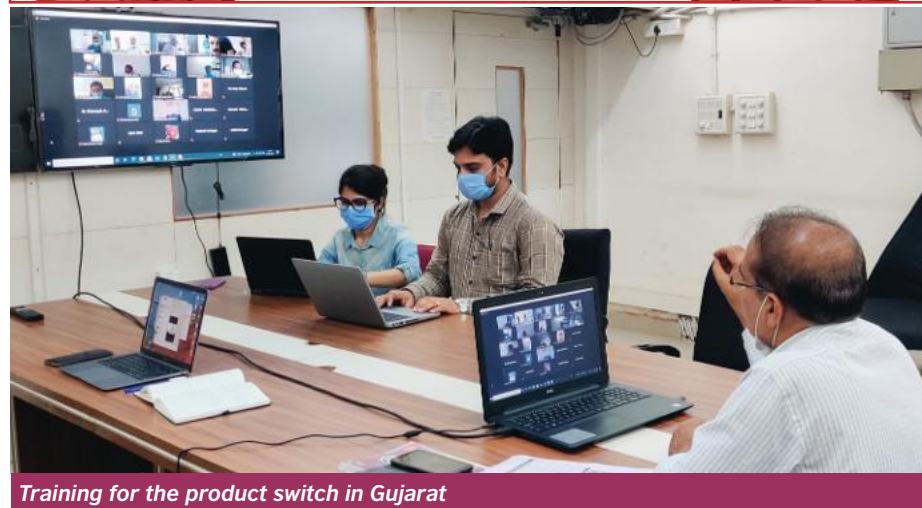
Training for the product switch in Gujarat

The new Rotavirus vaccine (RVV) product- Rotasil liquid will now be introduced in the Universal Immunization Programme (UIP) in few States and Union Territories (UTs). Rotasil liquid is indigenously manufactured and comes in a single dose packaging. For the new RVV liquid product, only the presentation has changed, with the vaccine schedule, route of administration, vaccine storage, contraindications and reporting and recording remaining the same. The national level training of trainers for the product switch has already been conducted. The selected states/ UTs will gradually switch to the new product after the currently used RVV product gets stocked out.