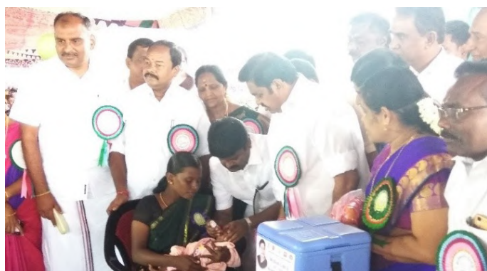
Rotavirus vaccine launched by Chief Minister Shri Thiru Edappadi K. Palaniswamy in Salem, Tamil Nadu

Rotavirus vaccine will help in reducing morbidity and mortality among children from rotavirus diarrhoea and will benefit nearly 1.8 million children in both the states annually. "The introduction of Rotavirus vaccine would mark a historic moment & a new milestone towards expanding immunisation in the state aimed at reducing child mortality. Adding this life-saving vaccine to our immunisation programme will not only improve the health of